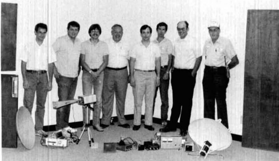
Members of the North Texas Microwave Society with their 10-GHz equipment assembled before the first weekend of an ARRL 10-GHz cumulative contest.