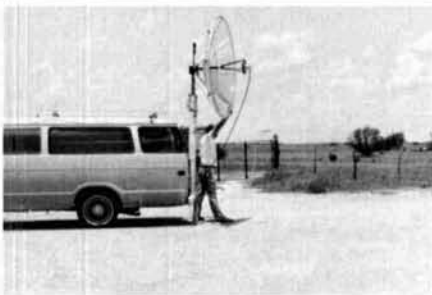
North Texas Microwave Society Expedition on 3456 MHz. Elevation is controlled by jacking up the rear of the van! WA5TNY is seen adjusting the dish.

microwave band, and the one most like the VHF/UHF bands in its operational characteristics. Novice operation is permitted between 1270 and 1295 MHz. Conventional vacuum tubes (2C39) can be used to generate power, and power levels of 100 watts aren't uncommon. Antennas are generally of the Yagi type (or loop Yagi where 1-wavelength loops replace the usual 1/2-wavelength elements like a multi-element quad). Antennas are quite small; a 25-element Yagi is a little over 6 feet long. Fixed station operation is common, and a well-equipped station can expect a DX range of several hundred kilometers under flat conditions. The California/Hawaii path has been worked on this band (3977 km) using modest power and antennas (N6CA's 100-watt, 44-element loop Yagi to KH6HME's 25-watt, 4 by 25-element Yagis). Under good conditions, distances of up to 100 km can be worked with