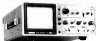
V-422 40MHz Dual Trace $795

V-660 60MHz Dual Trace $1,195 V-665 60MHz Dual Trace w/Cursor $1,345 V-1060 100MHz Dual Trace $1,425 V-1065 100MHz Dual Trace w/Cursor $1,695 V-1085 100MHz Quad Trace w/Cursor $2,045 V-1100A 100MHz Quad Trace w/Cursor $2,295 V-1150 150MHz Quad Trace w/Cursor $2,775