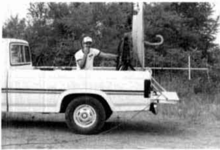
N5JJZ/5 demonstrates portable operation on 5760 MHz.